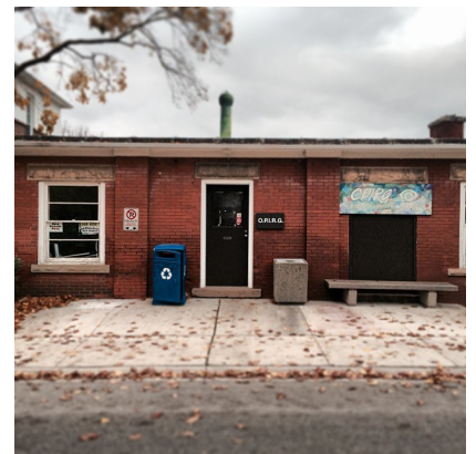
Our new office at 24 Trent Lane. Come visit!

* OPIRG Guelph acknowledges that our organization is located on occupied Attawandaron/Attawandaronk (Neutral) territory and we commit ourselves to anti-colonial struggles.