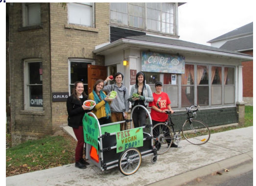
Food Not Bombs folks in front of 1 Trent Lane.

Thanks to a funding opportunity with the Ontario Ministry of the Environment and Climate Change, OPIRG teamed up with the City of Guelph and their River System Advisory Committee to implement the new project entitled Speed and Eramosa Rivers Riparian Enhancement Project. This new initiative diversified and rehabilitated degraded urban river banks through community-based naturalization activities.